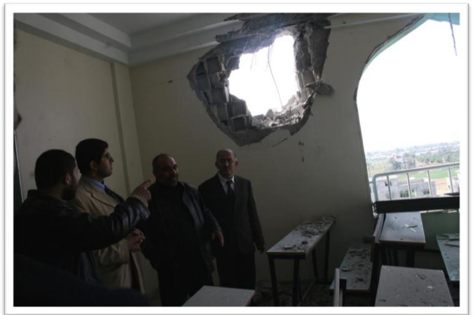
FIGURE 10 DAMAGES IN A CLASSROOM IN THE WESTERN STUDENT BUILDING.