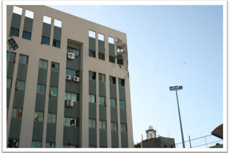
FIGURE 9 SOME OF THE DAMAGES IN THE WESTERN STUDENT BUILDING.