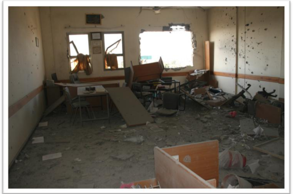
FIGURE 7 DESTRUCTION OF THE SCIENTIFIC RESEARCH AND CURRICULUM DEVELOPMENT UNITS.