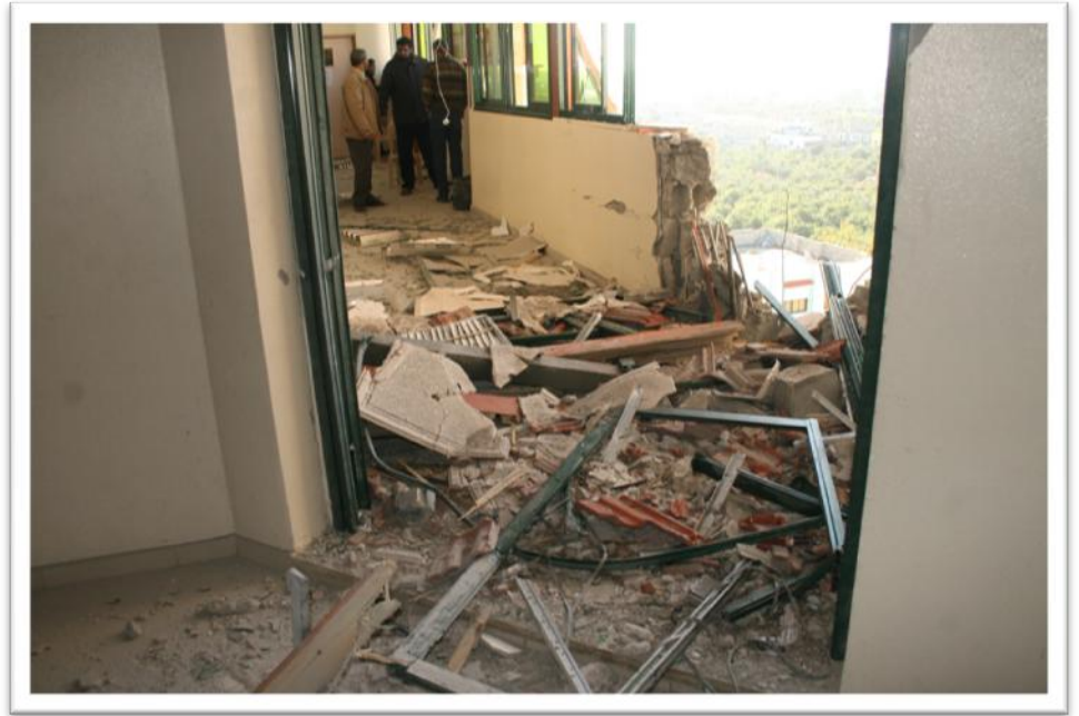
FIGURE 5 TANK SHELLS HIT THE 6TH FLOOR OF THE EASTERN STUDENT BUILDING.