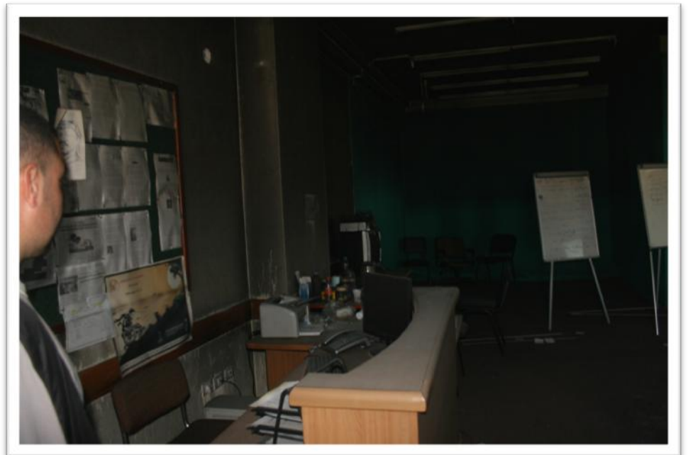
FIGURE 8 BURNED ANIMATION AND CARTOON DEVELOPMENT UNIT.