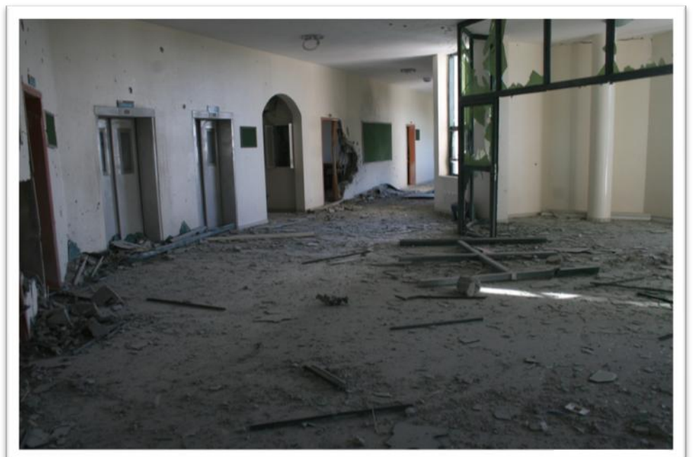
FIGURE 2 DAMAGE IN 5TH FLOOR OF EASTERN STUDENT BUILDING.