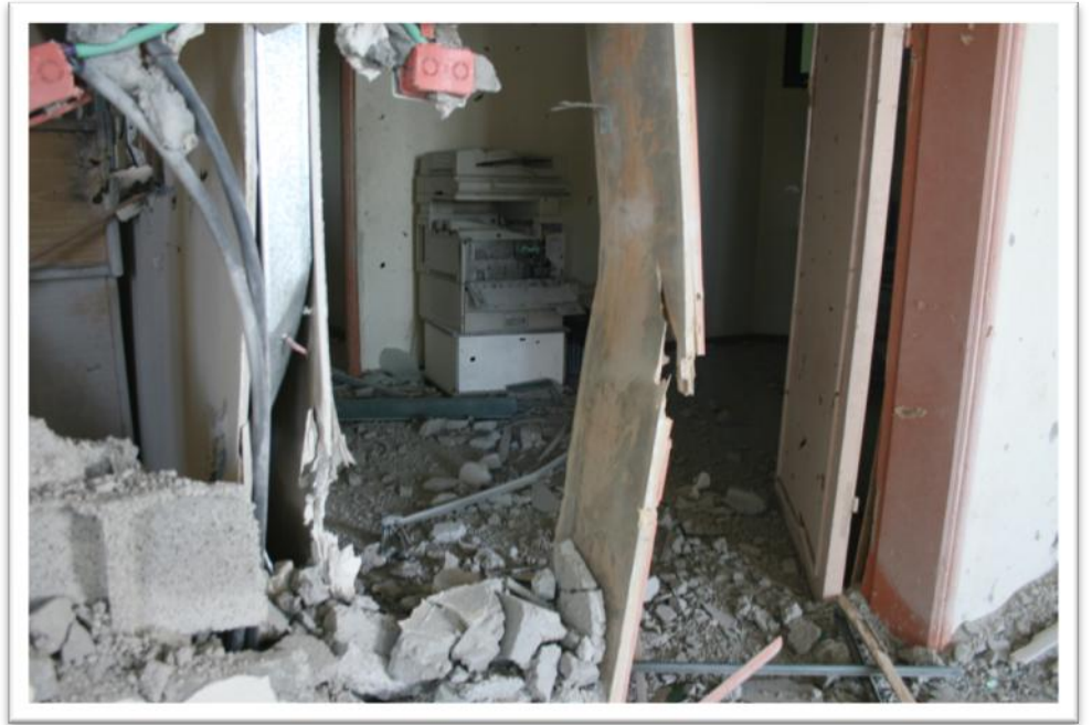
FIGURE 3 DAMAGE IN THE OFFICE OF SOME OF OUR INSTRUCTORS.