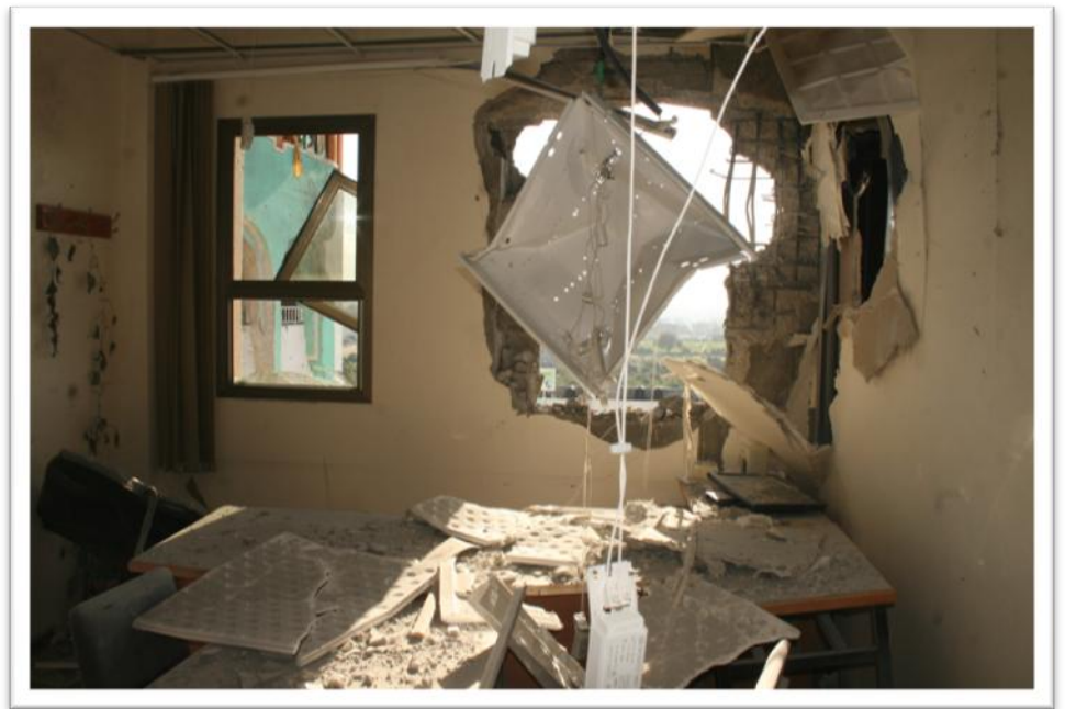
FIGURE 6 DAMAGE TO THE OFFICES OF THE ADMINISTRATIVE AFFAIRS.