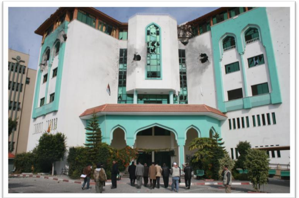
FIGURE 1 UCAS ADMINISTRATION TOURING THE CAMPUS WITH AN INTERNATIONAL DELEGATION.